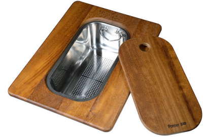
Iroko-wood sliding chopping board with stainless steel colander

* only in combination with the accessory 8644 101