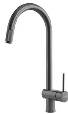
VOLTA GUN METAL 8491 106